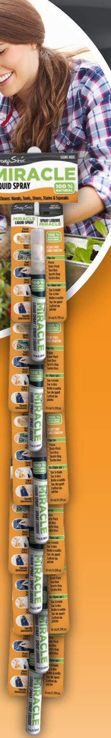
SoapStix Miracle Liquid Spray 12 Unit Clip strip