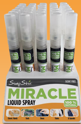
SoapStix Miracle Liquid Spray 30 Unit Counter Display