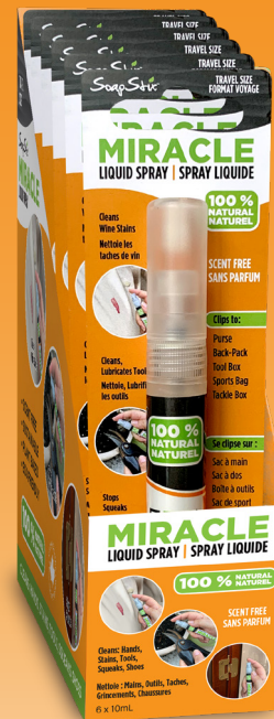
SoapStix Miracle Liquid Spray 6 Unit Counter Display