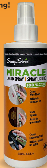
SoapStix Miracle Liquid Spray 250 mL bottle